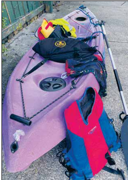
The kayak which the rescued man was fishing from had a plastic bag squeezed into the hole to replace a lost bung and a missing hole covering

Kath asks people to, "Please make sure your gear is