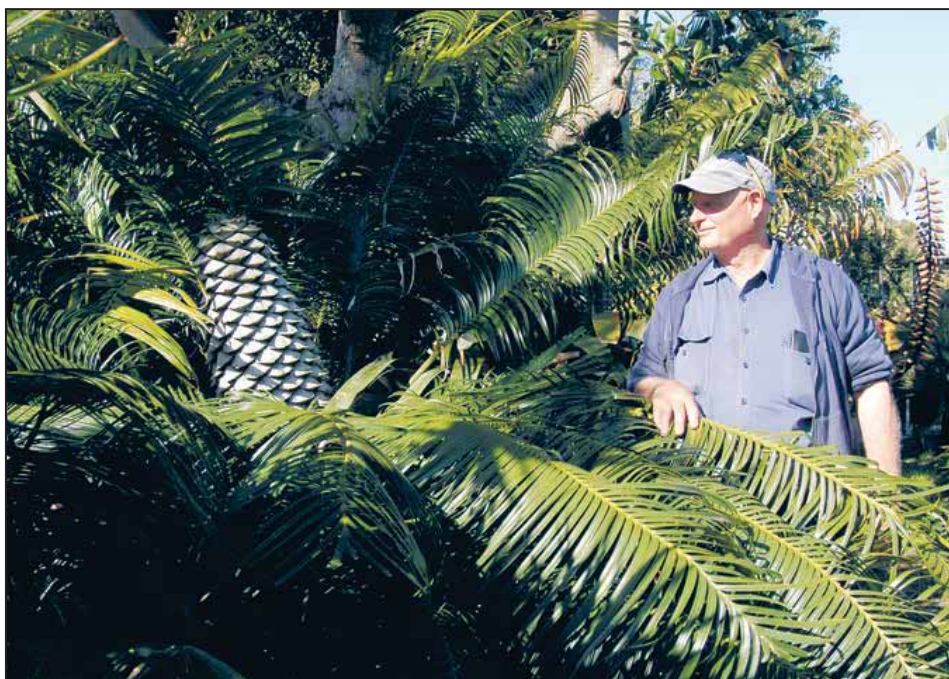
The giant female cycad.

On a sunny afternoon surrounded by a multitude of exotic plants and the soft scent of a flowering boronia wafting in the air, the Bream Bay Green World wholesale nursery in One Tree Point is paradise.