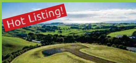
Lot 18 Millennium Way, Waipu