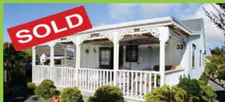
33 Shoemaker Rd, Waipu

Visit www.whangareimoxyhire.co.nz or call 09 434 4272