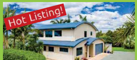
381 Cove Rd, Waipu