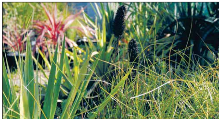
Gasses with sculptural seed heads