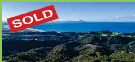
Cullen Road, Bream Bay Ridge