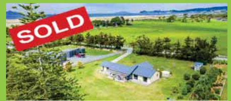
25 Johnson Point Road, Waipu