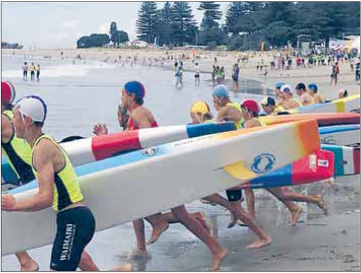
The start of the under 14 board race

The national junior surf lifesaving championships were held at Mount Maunganui from 7th to 10th of March with 857 competitors from around the country competing in the under 11 to under 14 categories and around 110 plus athletes in each division. Local clubs Omanu and Mount Maunganui dominated the competition.