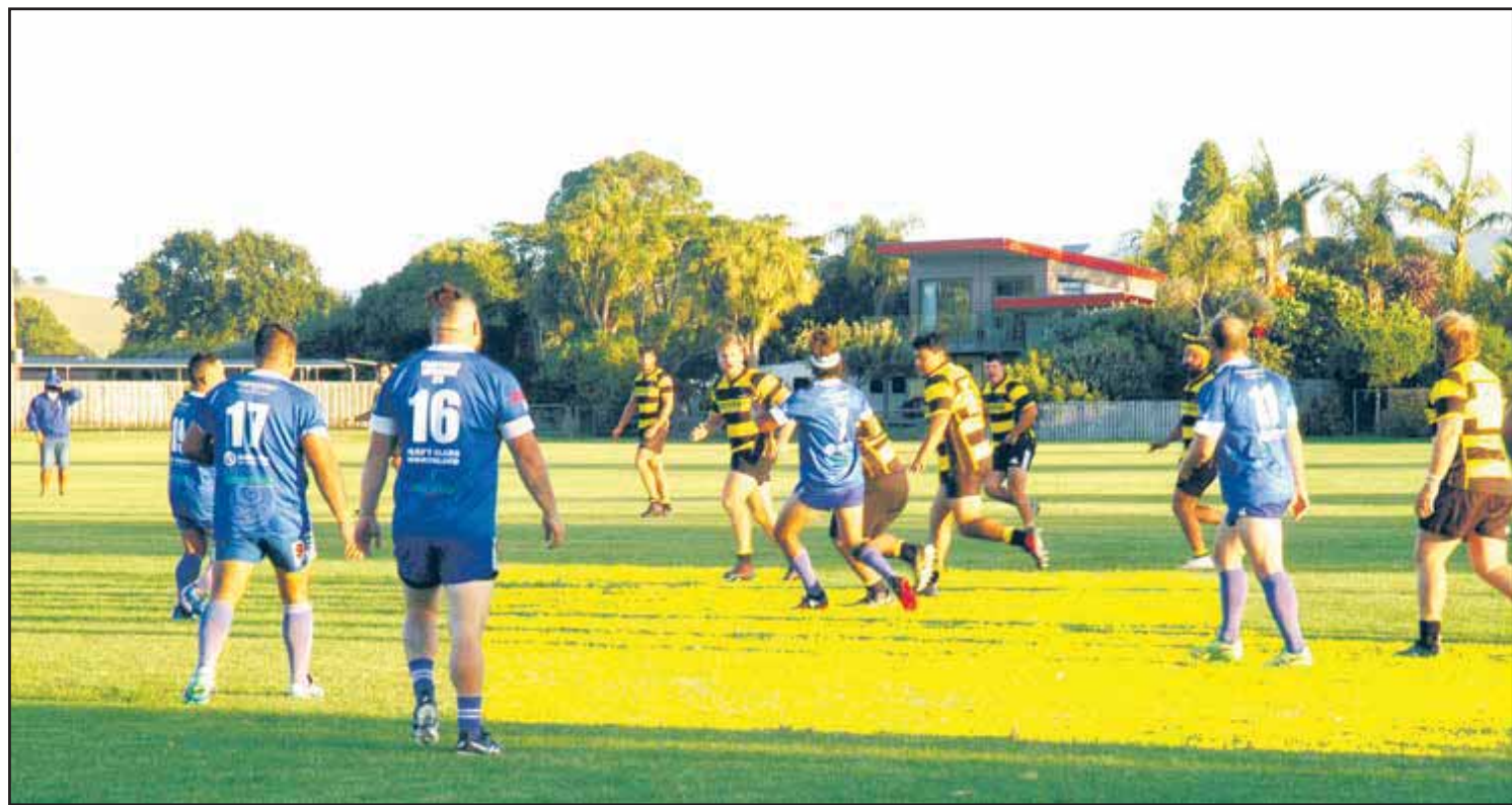
Takahiwai League in blue and Waipu Rugby in the yellow and black stripes, in a pre-season mixed code game at Waipu