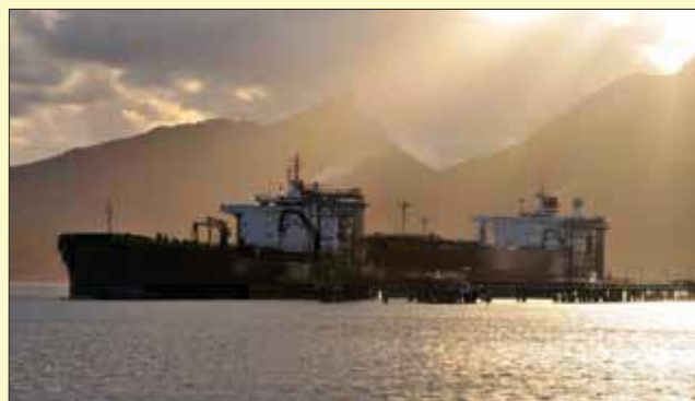
The coastal tanker Kakariki loading refined oil products on Jetty 2 at the Marsden Point Oil refinery.