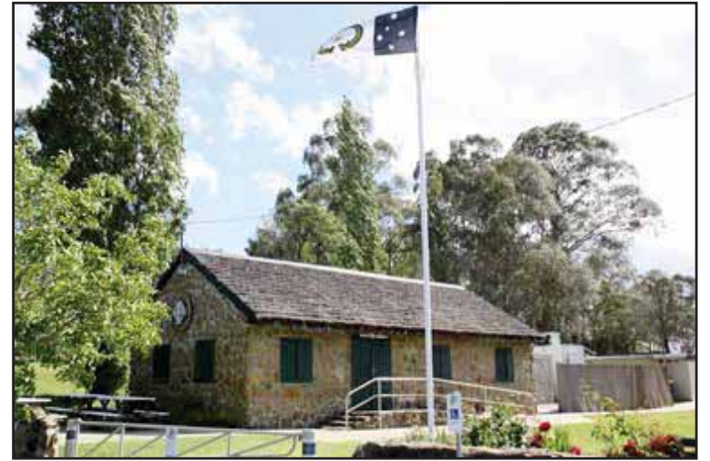
Replica Crofters cottage in Glen Innes, New South Wales

In regard to the discussion about plans for the Waipu Museum, I have just visited Glen Innes in New South Wales, where we visited the Australian Standing Stones and Crofter's Cottage. This project was largely completed by a few dedicated citizens who are committed to acknowledging Glen Innes' Celtic Heritage. The replica crofter's cottage was built to remember these pioneers and the area is the home of the Australian Celtic Festival. Why are we considering hiding our beautiful House of Memories?