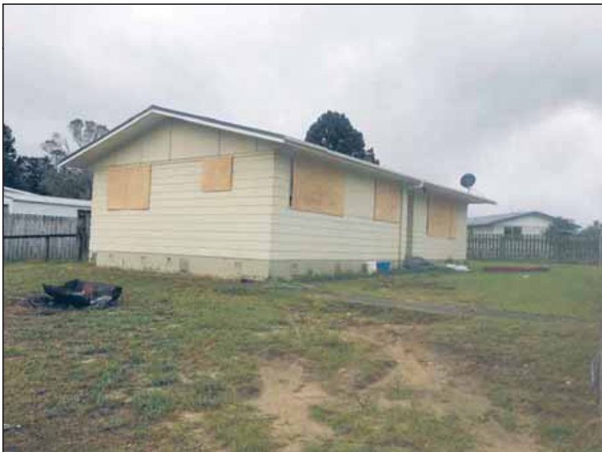
The state house agency Kāinga Ora is in the process of repairing and cleaning up the house for new tenants

This house in Tamangi Street in the Ruakākā Village with its windows boarded up, old mattresses left in the yard, a broken front fence and the remains of a fire on the front lawn is the property of the state. Neighbours say the previous occupants caused problems in the street with all night parties and loud music. One said he had made numerous complaints and was pleased when they packed up and left.